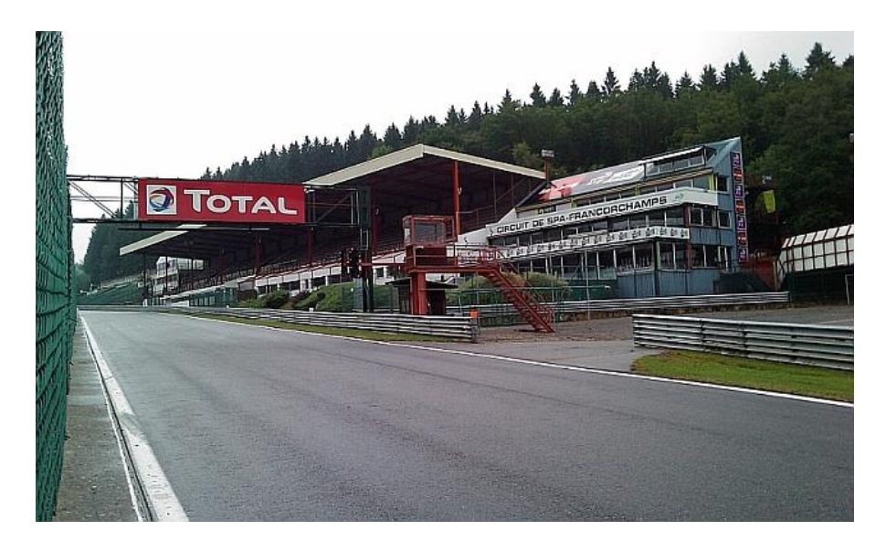
Photo of the down hill start line just before Eau Rouge, taken during Spa trackday, july 2010.

Now heavy braking into the right, left, right that is the new 'fidely' bus stop. Important to keep off the green matting in the wet as it's slippery! The GP pit lane entrance will now be on your right. A simple right left which is flat then brings you onto the start/finish line for the uphill run to La Source. La Source is great fun and if not racing time for a little back end out for the camera. Important to go in slow and get the power on early, the new La Source has a fair amount of run off on the exit unlike the original which sucked you into the wall. Now on to the steep run down to Eau Rouge for another great lap.