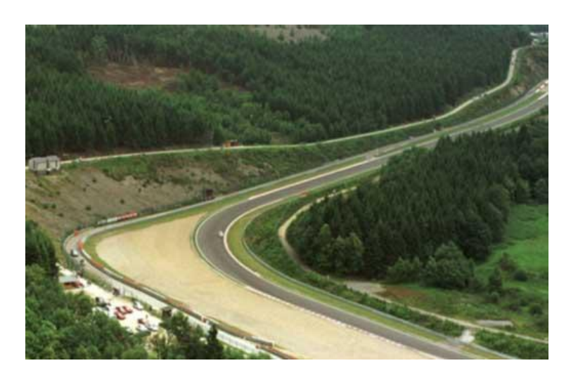
Photo showing double left at Pouhon corner, taken from sportfahrerschule.de

Next it's into the fun right then left that is Des Fagnes and a chance of a breather. Get over to the left on the exit in time for Stavelot. Stavelot is in fact 2 corners aptly named Stavelot 1 and Stavelot 2. 1 is a 90 degree right hander with a slight dip that rolls into another 90 degree right hander for S2, keeping up speed in this complex is important. In an Elise you need all the speed you can get for the long run down to Blanchimont. There's a small left hand turn just before the main corner which most will take flat out. A late turn in hitting a late apex should ensure braking isn't required.