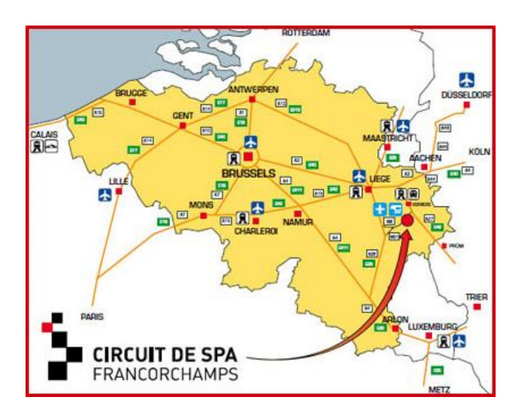
Map of Belgium showing the location of the Spa circuit

This roller-coaster track, located approximately 50km south east of Liege, courses along the contours of the Ardennes Mountains with a beautiful natural flow. It contains every conceivable challenge a Grand Prix driver could wish for and arguably the world's toughest corner. Eau Rouge has been neutered a little now it is flat-out in all conditions but it is still a thrilling challenge.