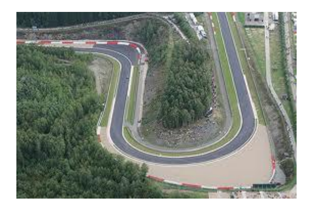
Photo showing Rivage 1 (right corner) followed by Rivage 2 on the left

Finally at the end of Kemmel it's the right left of Les Combes which is pretty simple followed by the 90 degree right of Malmedy. It's then flat out up to another major corner that can cause a lot of problems, Rivage 1, A 180 degree right hander with a lot of negative camber on the outside so a late turn in and tight apex are important to avoid that camber.